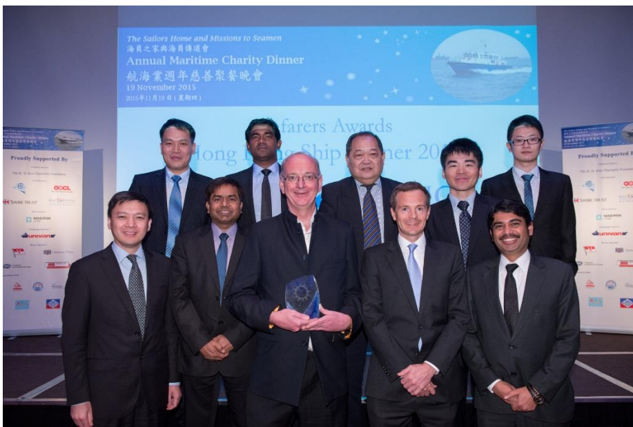
Wah Kwong's employees celebrating after the awards.