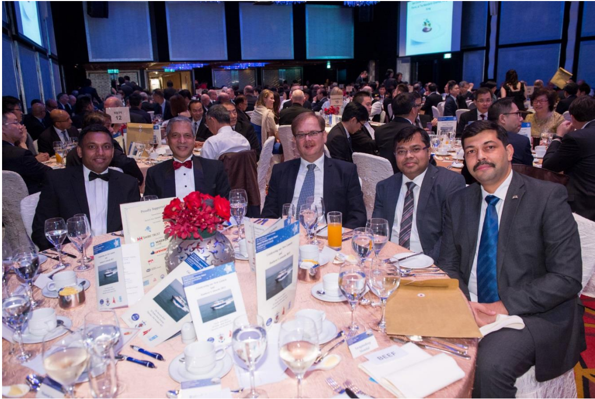
Over 290 attended the 3 rd Annual Maritime Charity Dinner held at The Sheraton Hong Kong on 19 th November 2015